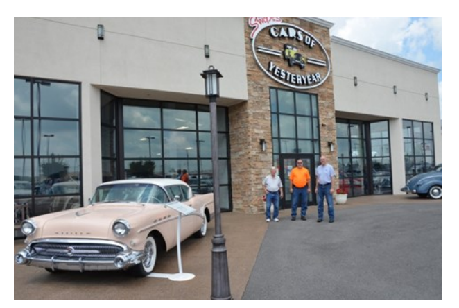
Trip to E-town for the Cars of Yesteryear Museum