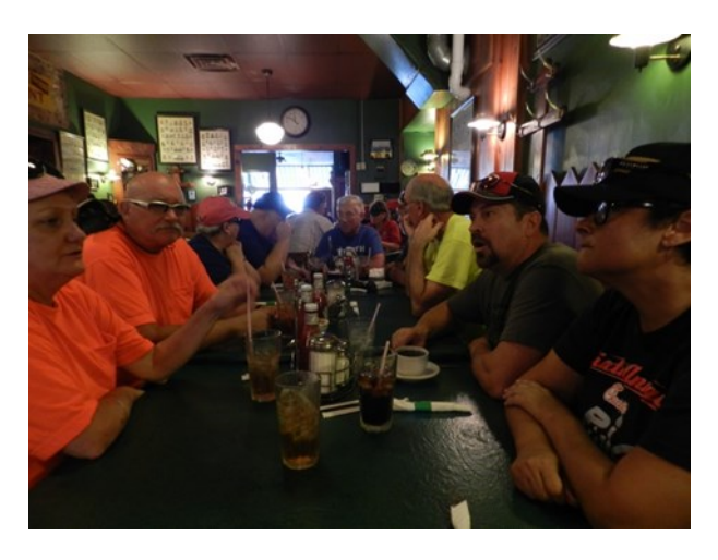
Post Blast dinner at Miguel's