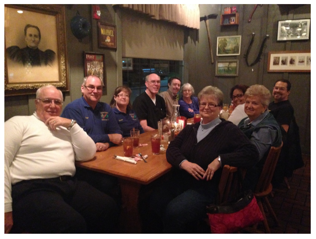
Cracker Barrel November 2013!