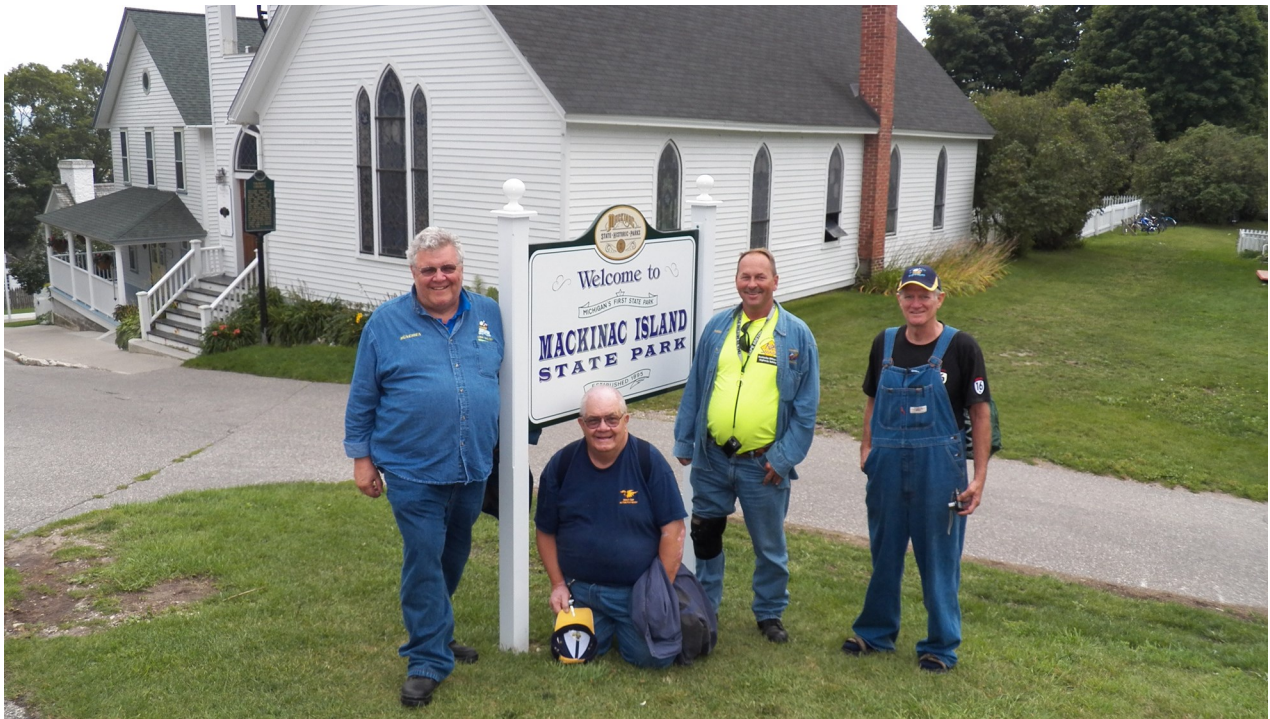
The Cupcakes enjoy a northern trip to Michigan