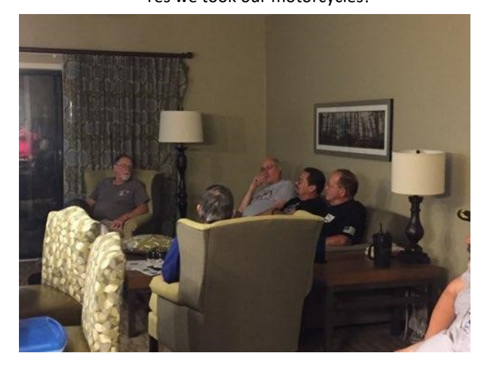
A little guy talk going on!