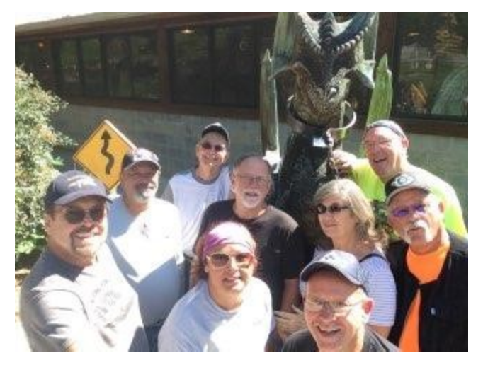
More from Deal's Gap!