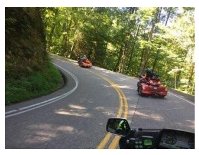
Sightseeing on the Cherahola Skyway