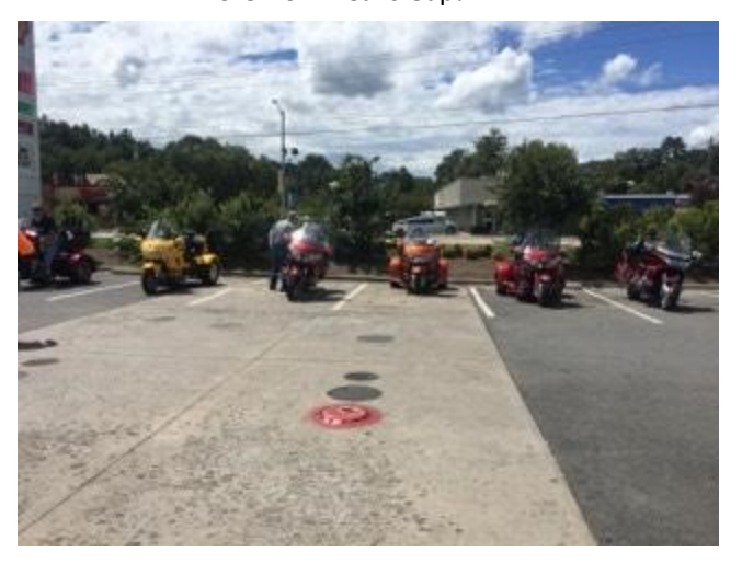
Yes we took our motorcycles!