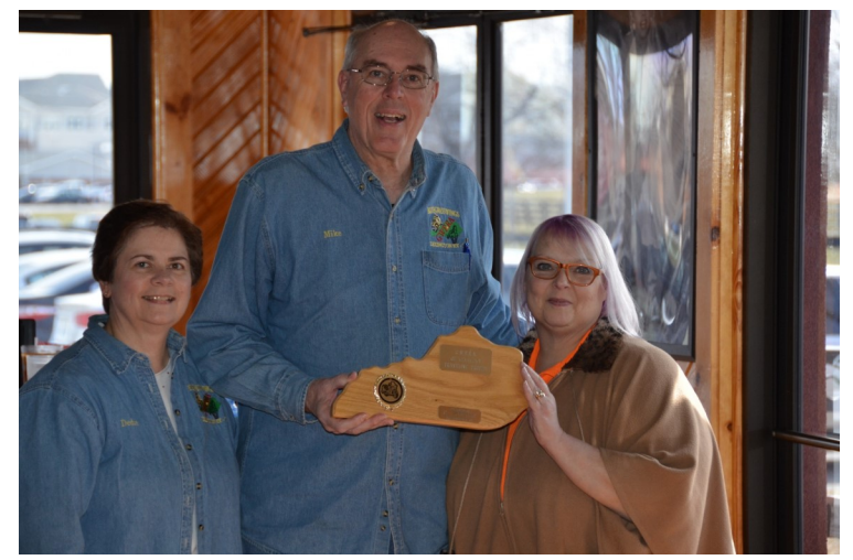
Chapter H won the traveling plaque at our February gathering.