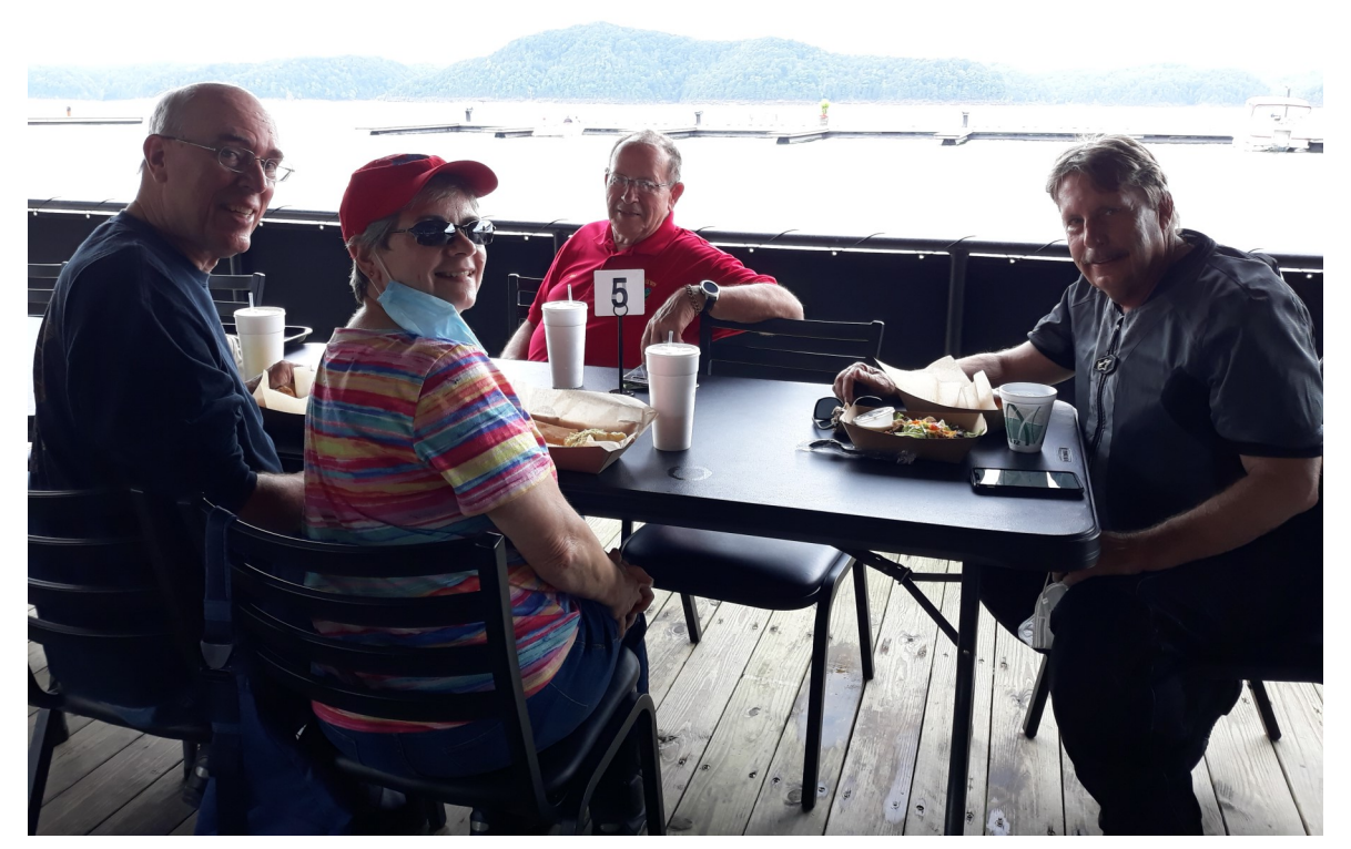
View from the Marina Rowena.