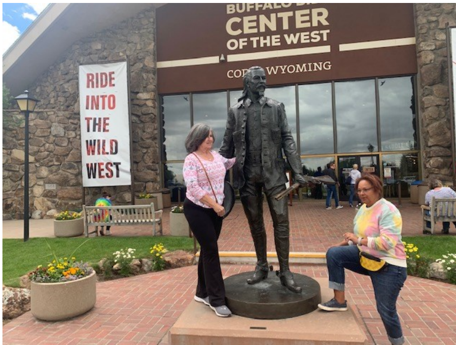
July 24 Ride with Chapter A