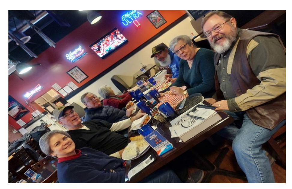
Dinner at DaVinci's with great friends and great food!

For more information about the rides and future dates please see our events calendar at: <a href="http://www.kybluegrasswings.org/events/">http://www.kybluegrasswings.org/events/</a>. If you want to see photos from our past events, check out the following page: <a href="http://www.kybluegrasswings.org/photos/">http://www.kybluegrasswings.org/events/</a>.